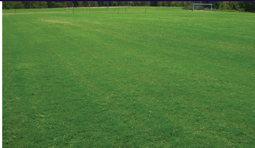
3 weeks later