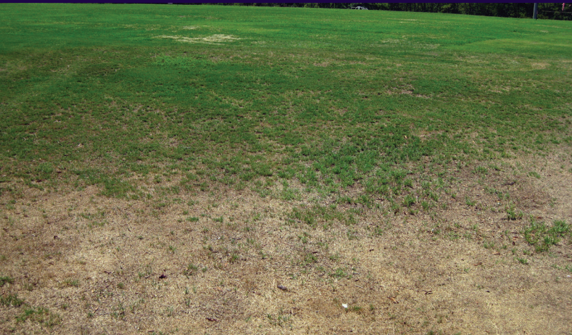
Bear Branch soccer field